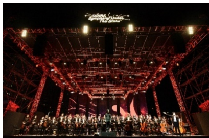
Swire Symphony Under The Stars 2021 at the Central Harbourfront